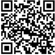
A4 Black and White