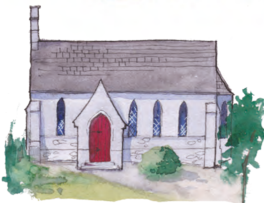
4. St Peter's Church