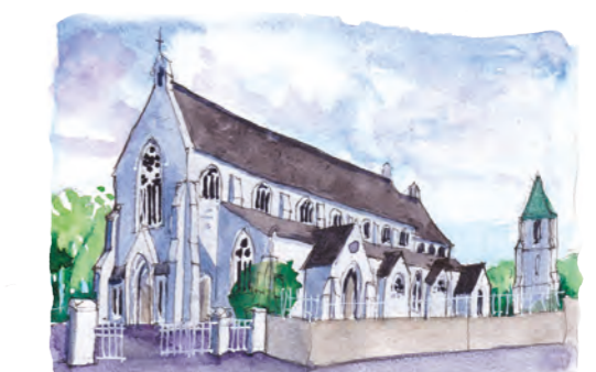
11. Church of the Immaculate Conception