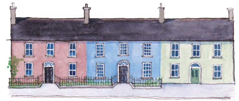
5. Egmont Place