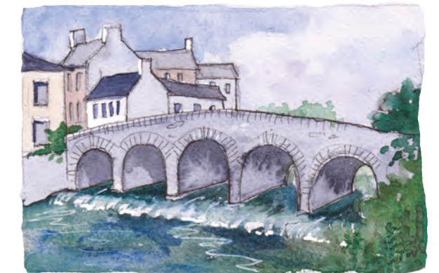
Kanturk Bridge [1]