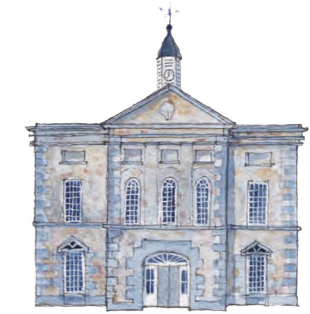
16. Market House