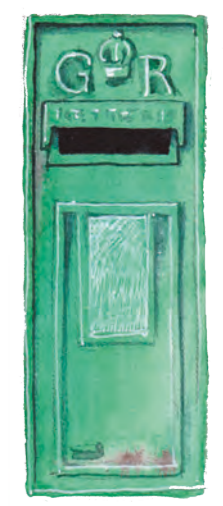
22. Post Box