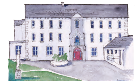
12. Sisters of Mercy Convent