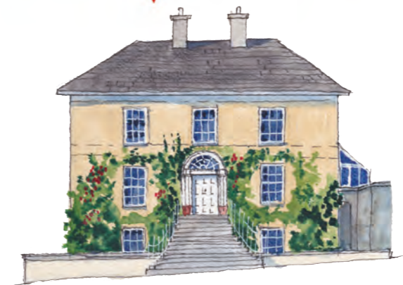
6. Egmont House