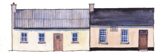
18. Vernacular house & 17. Trade Union hall