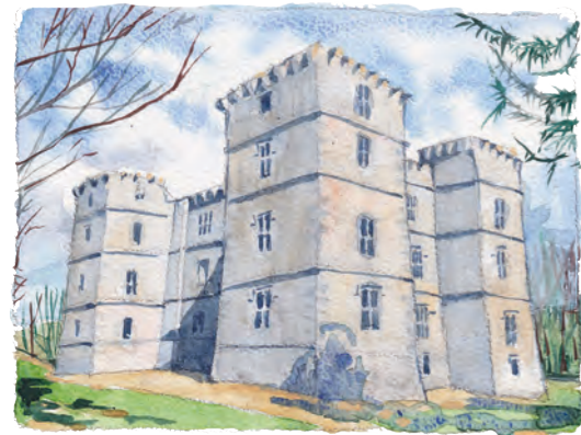
20. Kanturk Castle