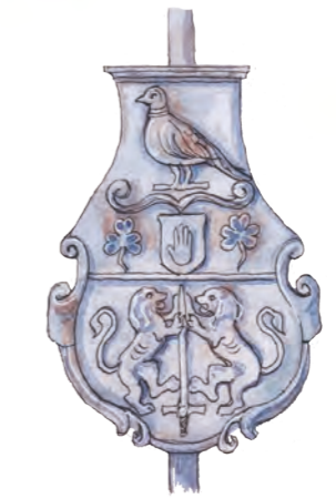
9. Tierney Coat of Arms