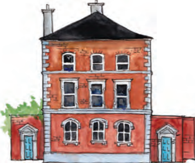
13. Bank of Ireland