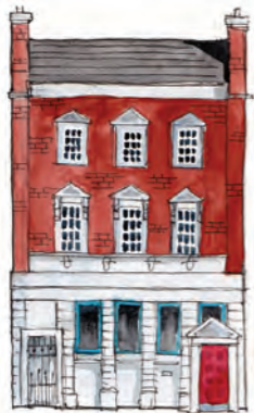
12. Former Bank