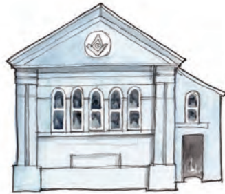
9. Masonic Lodge