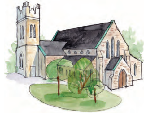
6. Abbeystrewry Church