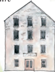
2. Steam Mill