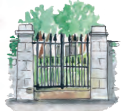
18. Old Protestant burial ground