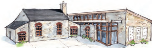
1. Old gas works, now Skibbereen Heritage Centre