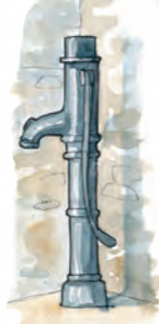
10. Old Water Pump