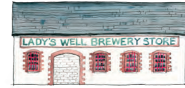
5. Brewery Store