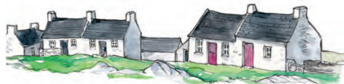
17. The Rock as it looked in c.1900 (based on a Lawrence Collection photograph)