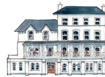
4. West Cork Hotel