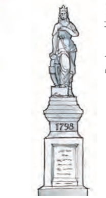
15. Maid of Erin