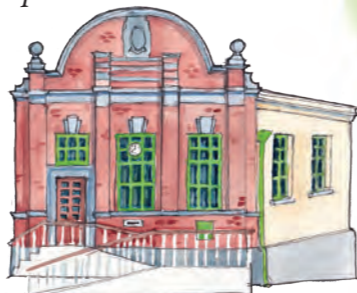
14. Post Office