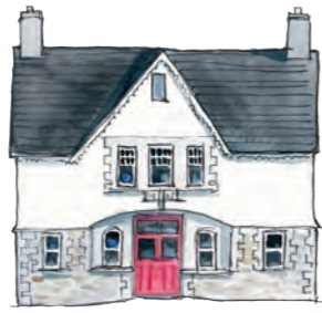
7. Church Hall