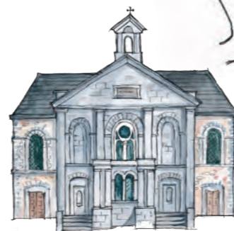
20. St Patrick's Cathedral