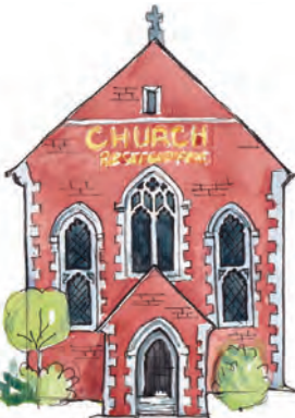
8. Wesleyan Chapel

Some 28000 people died in the Skibbereen area during the Great Famine of 1845 to 1850