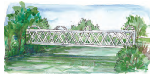
3. Railway Bridge