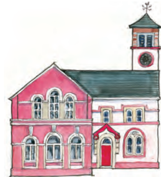
16. Town Hall