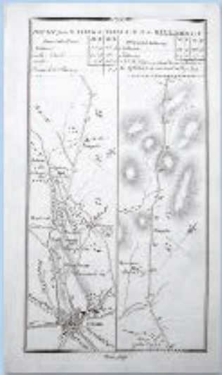
Left: Oileain Chléire Below: Excerpt from Taylor and Skinners Maps of the Roads of Ireland, showing the Butter Road, surveyed 1777 Traditional Shopfront, Rosscarbery