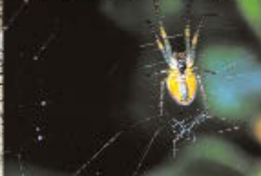
Photos this page • Street Sign, Mitchelstown • James Fort, Kinsale • Common Spider Opposite page • Aerial view of Cork Harbour