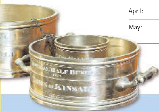
Above: Cappeen Ringfort Left: The Imperial Measures, Kinsale Town 1824