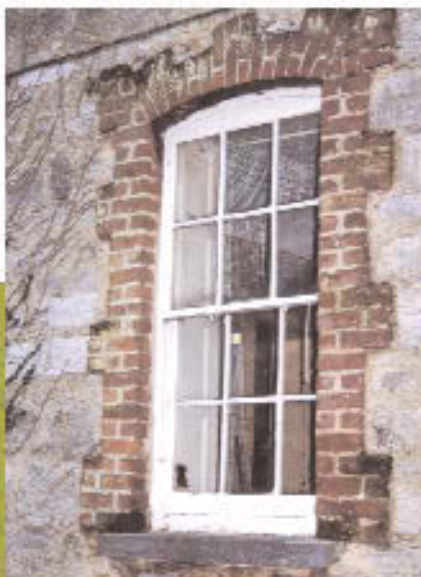
Above left: Ballinadee Post Office Left: Window at Kingston College, Mitchelstown Right: View of Cork Harbour from Glenbrook