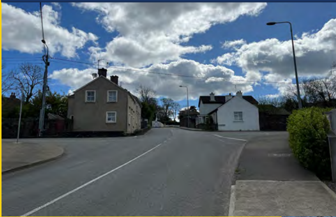
Fosters Cross Looking South in the Direction of Rose Hill