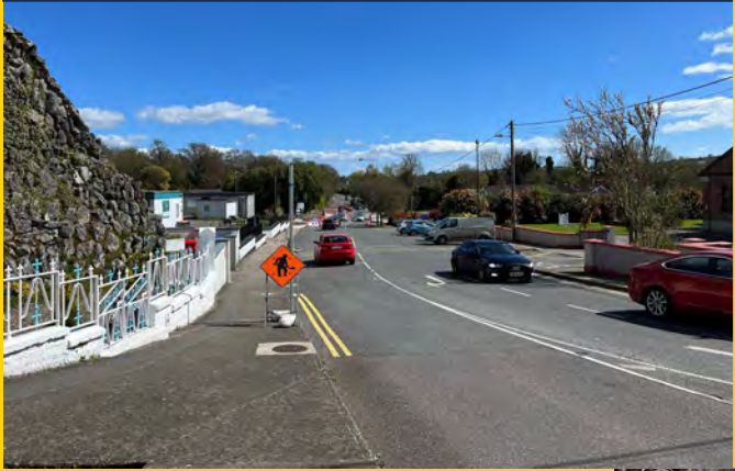
R613 Church Road Looking East