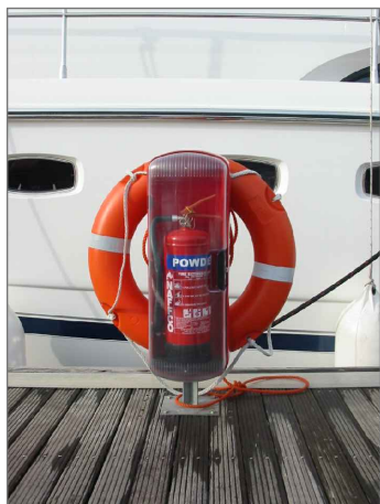
Lifebuoy / Fire Extinguisher