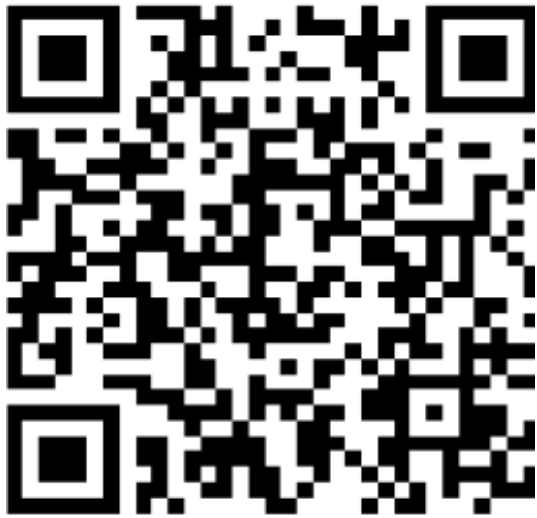
A4 Black and White