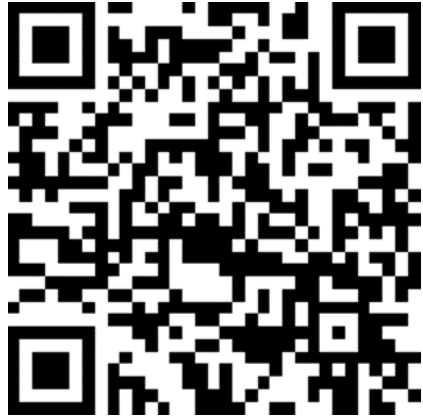
A4 Black and White