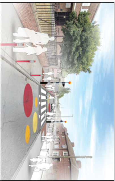
Proposed Pedestrian/School Crossing Pencil Type Bollards