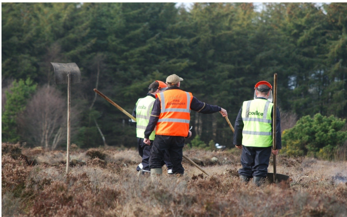
Coillte Supervisor briefing operatives in advance of burning at a prescribed burning exercise

Landowners/managers should familiarise themselves with the requirements of The Safety, Health and Welfare at Work Act, 2005 and Safety, Health and Welfare at Work (General Application) Regulations, 2007 and ensure compliance with legislation.