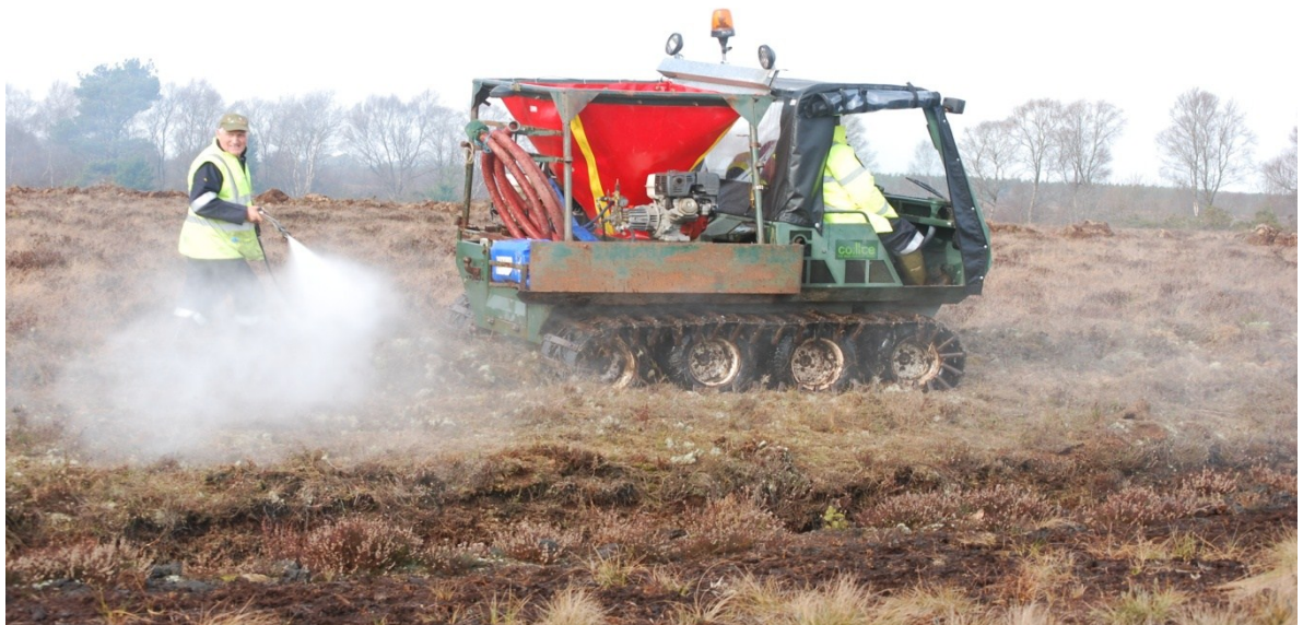
High pressure pumps, such as pressure washers can be mounted on ATV's or tractors and make short work of laying down control lines using water.

Portable water pumps or pressure washers mounted on a 4X4, tractor, ATV or quad bike can be used to wet down vegetation or extinguish unwanted fires. Petrol driven pressure washers are ideal for use as improvised foggers. Fine high pressure sprays use water more efficiently than coarse sprays or water jets, and can also be used to cool coarse fuel fires to within controllable limits.