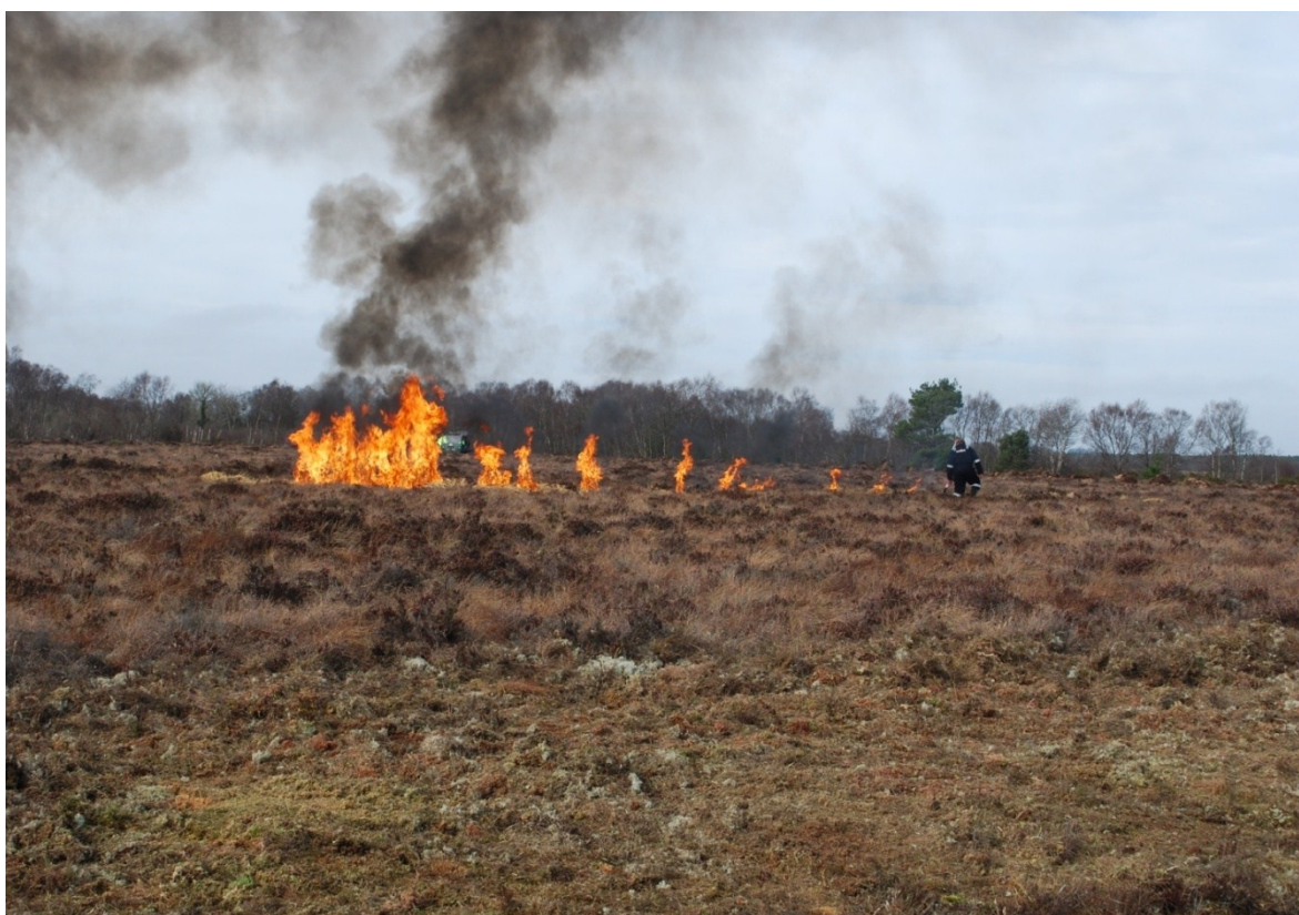
Prescribed burning operative igniting vegetation using a kerosene drip torch. Petrol or other highly flammable accelerant should never be used to start fires.

produce a relatively fast but controllable 'head fire' that will burn off fine surface vegetation without over-heating surface soil layers.