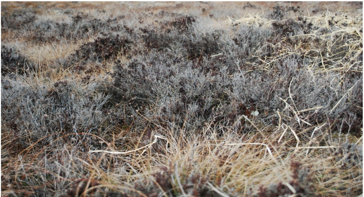
Fine Fuels, such as heather, mosses, gorse and grasses largely define the intensity of a fire, in conjunction with wind and moisture conditions.

The most critical types of fuels for fire management are fine fuels, such as grasses, heather foliage, mosses etc. and dead material (necromass). Typically fine fuels are defined as being less than 6mm ( \frac{1}{4} inch) in diameter. Due to their fine nature, these fuels can rapidly absorb or release moisture, depending on prevailing weather conditions, hence the importance of relative humidity in determining prevailing wildfire risk. Typical fuel species encountered in Irish upland conditions include Heather ( Calluna vulgaris ), Bell heather ( Erica cinerea ), Gorse ( Ulex europaeus , Ulex galii ), Purple Moor Grass ( Molinia caerulea ), Deer Grass ( Trichophorum caespitosum ), Bracken ( Pteridium aquilinum ) and Rush species ( Juncus spp. ). In most upland habitats, heather will be the preferred species for biodiversity and game development, and is makes for better winter sheep grazing.