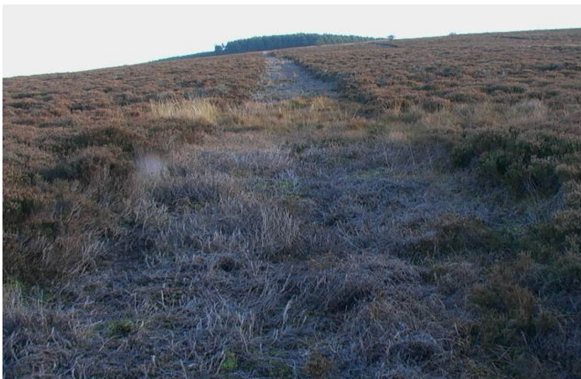
Mechanically prepared firebreak (Flail Mown) in extensive upland Heather terrain

For optimum control to be implemented, not more than 0.5 of a hectare (about 1.25 acres) should be burning within control lines at any one time, in order to minimise smoke and maintain fire control, particularly in upland grassland situations. Individual fires must be supervised at all times.