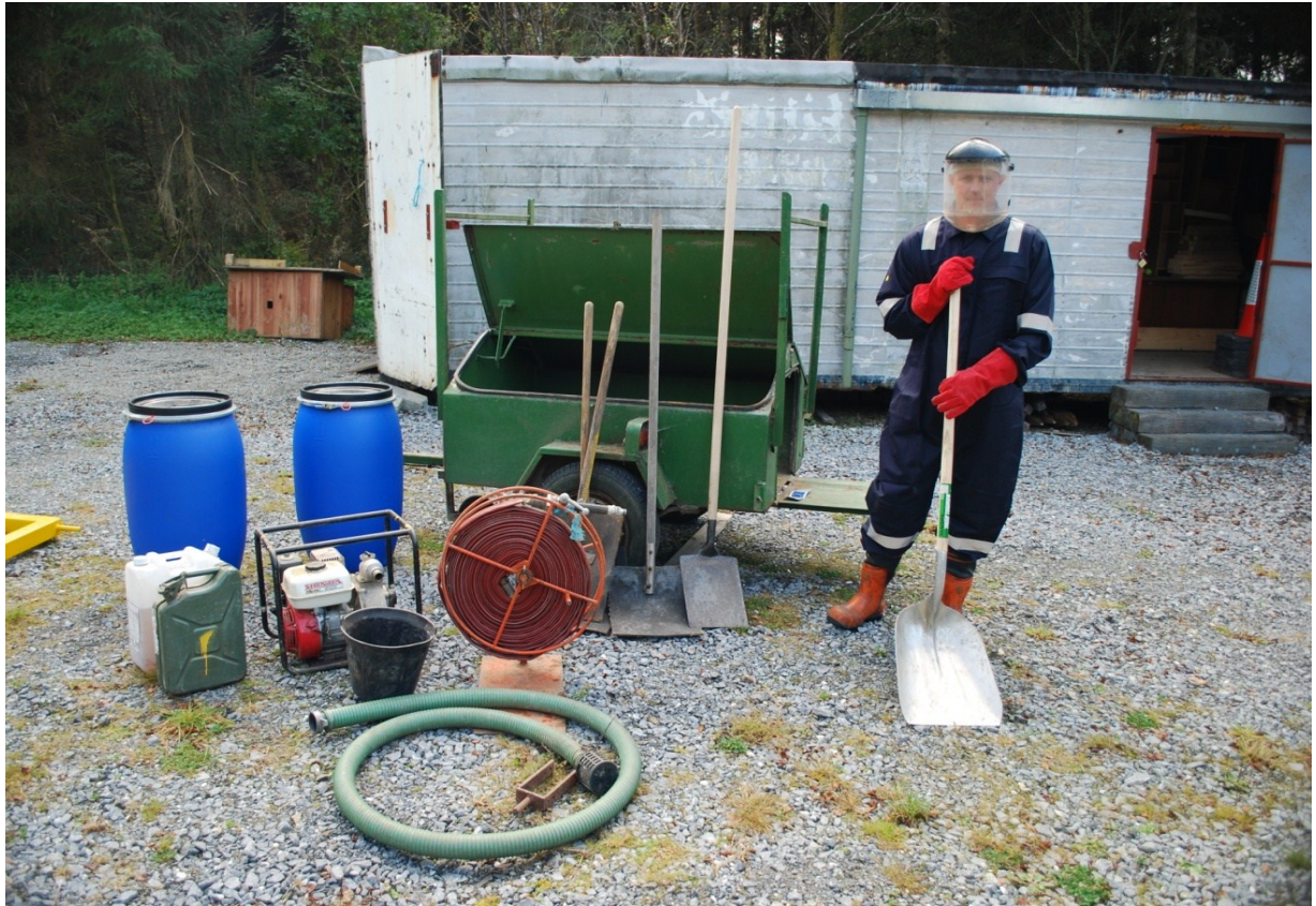
A suitably well-equipped prescribed burning operative and equipment.

On completion of the operation, equipment should be checked and serviced ready for future use, or in the event of emergency.