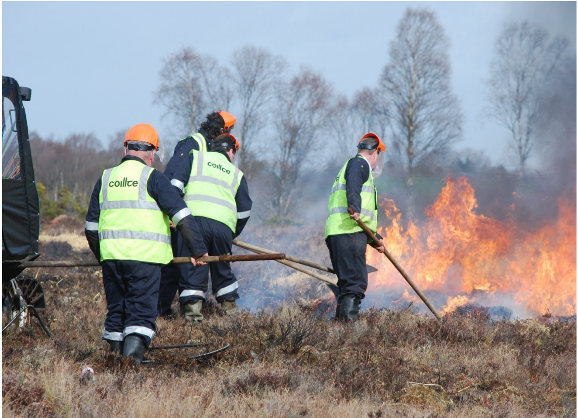
Prescribed burning requires sufficient manpower if it to be accomplished safely and correctly.

Co-operation between neighbours is vital in implementing effective burning. Neighbours should work together and share manpower resources to best effect. Remember the ' Meitheal ' ways of old. As in the past, landowners should organise Meitheal groups for prescribed burning in conjunction with neighbours.