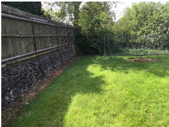
Figure 4 View inside the Carrig Na Curra estate at the proposed route of the Pedestrian Link to the back of the School Campus