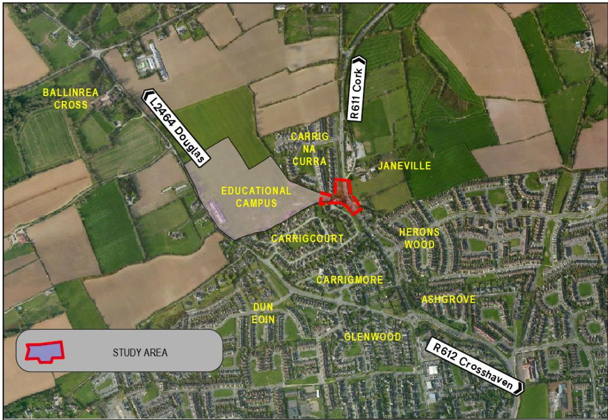
Figure 1 Study Area