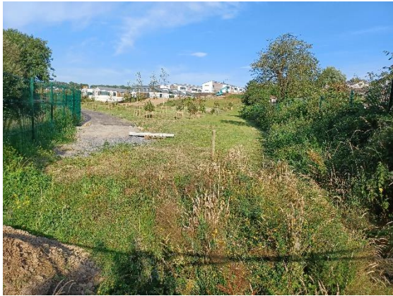
Figure 6 View from inside of Carrig Na Curra estate towards the School Campus with Footpath Completed on school grounds