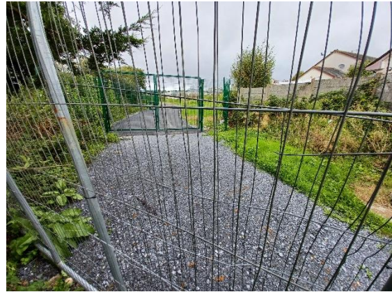
Figure 7 View from inside of Carrig Na Curra estate towards the School Campus with Footpath terminated at the rear gate