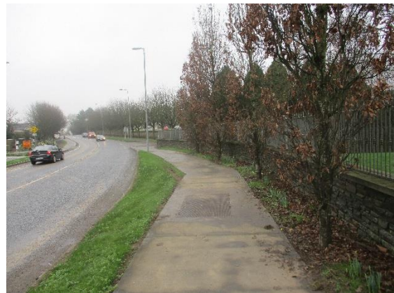
Figure 3 View from the location of the proposed Pedestrian Link along R611 Cork Road towards the Carrigaline town centre