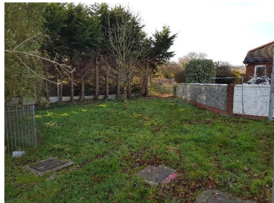
Figure 5 View from inside of Carrig Na Curra estate towards the back of the School Campus site