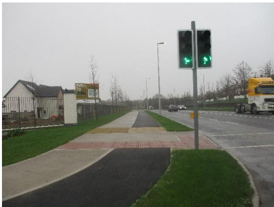
Figure 2 View from Janeville-Carrig Na Curra junction along R611 Cork Road towards the Carrigaline town centre

There is a need, in order to encourage and promote sustainable travel and also in order to reduce the amount of vehicular traffic, to provide an alternative connection to the school grounds which will enhance accessibility particularly between those residential areas and the education services. Also, the condition imposed by the An Board Pleanála (ABP) for the 3-school campus (PL.04.246387, 15/4388) – “a new pedestrian/cycle link within the site shall be provided from the south-eastern corner of the proposed campus site to adjoining lands so as to link up with the R611 regional road and associated footpath”.