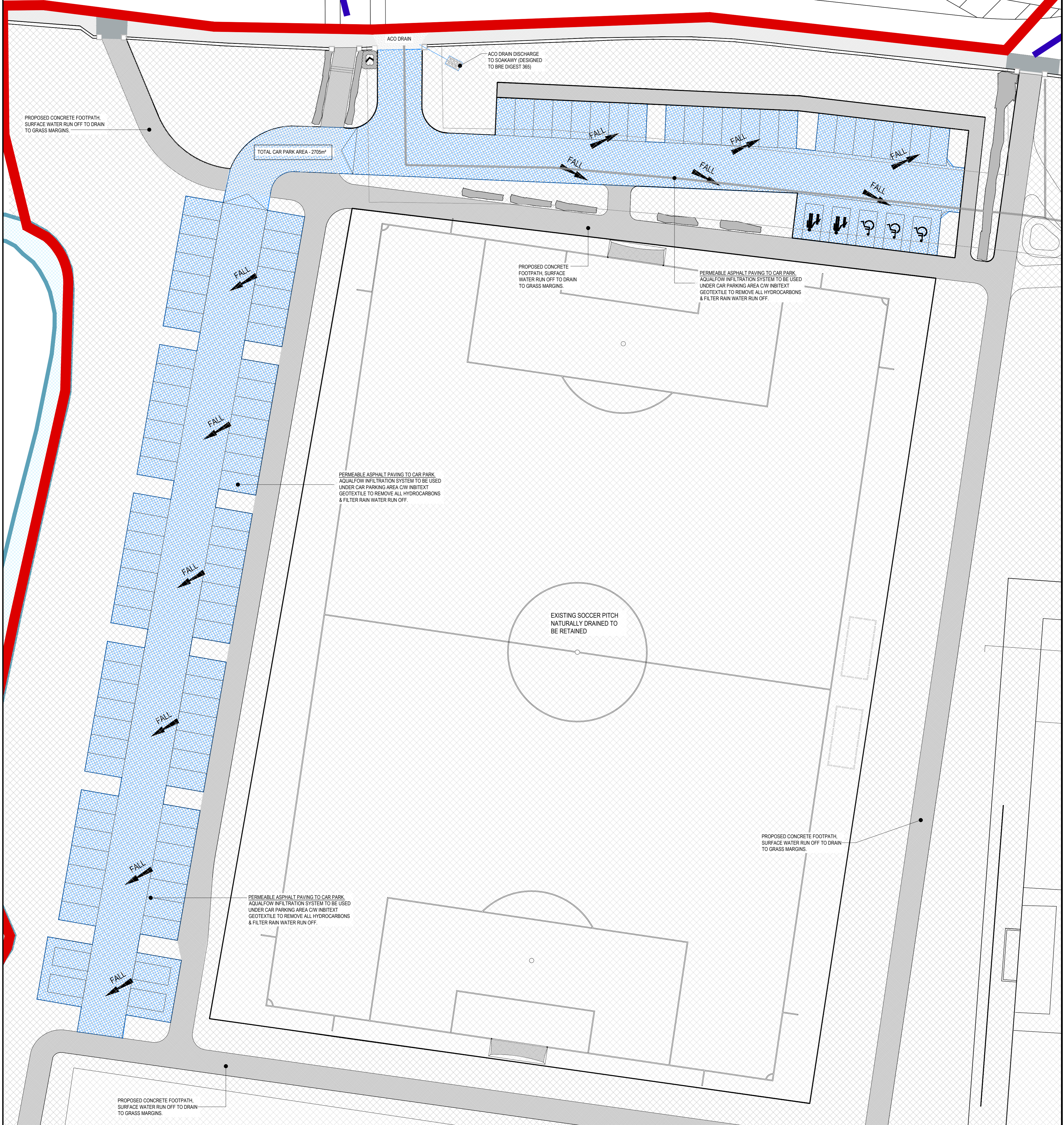
PROPOSED STORM WATER LAYOUT TO NEW CAR PARK SCALE 1:250