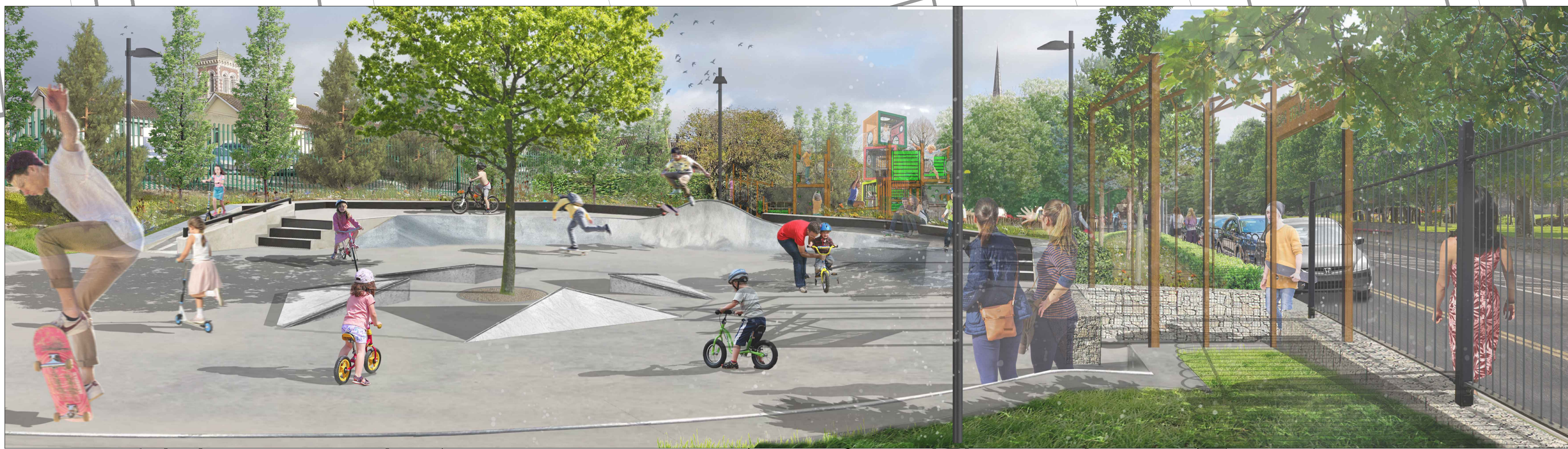
Artist's Impression / Photocollage of Improvement works in the Mallow Town playground. View from Park Road Playground entrance