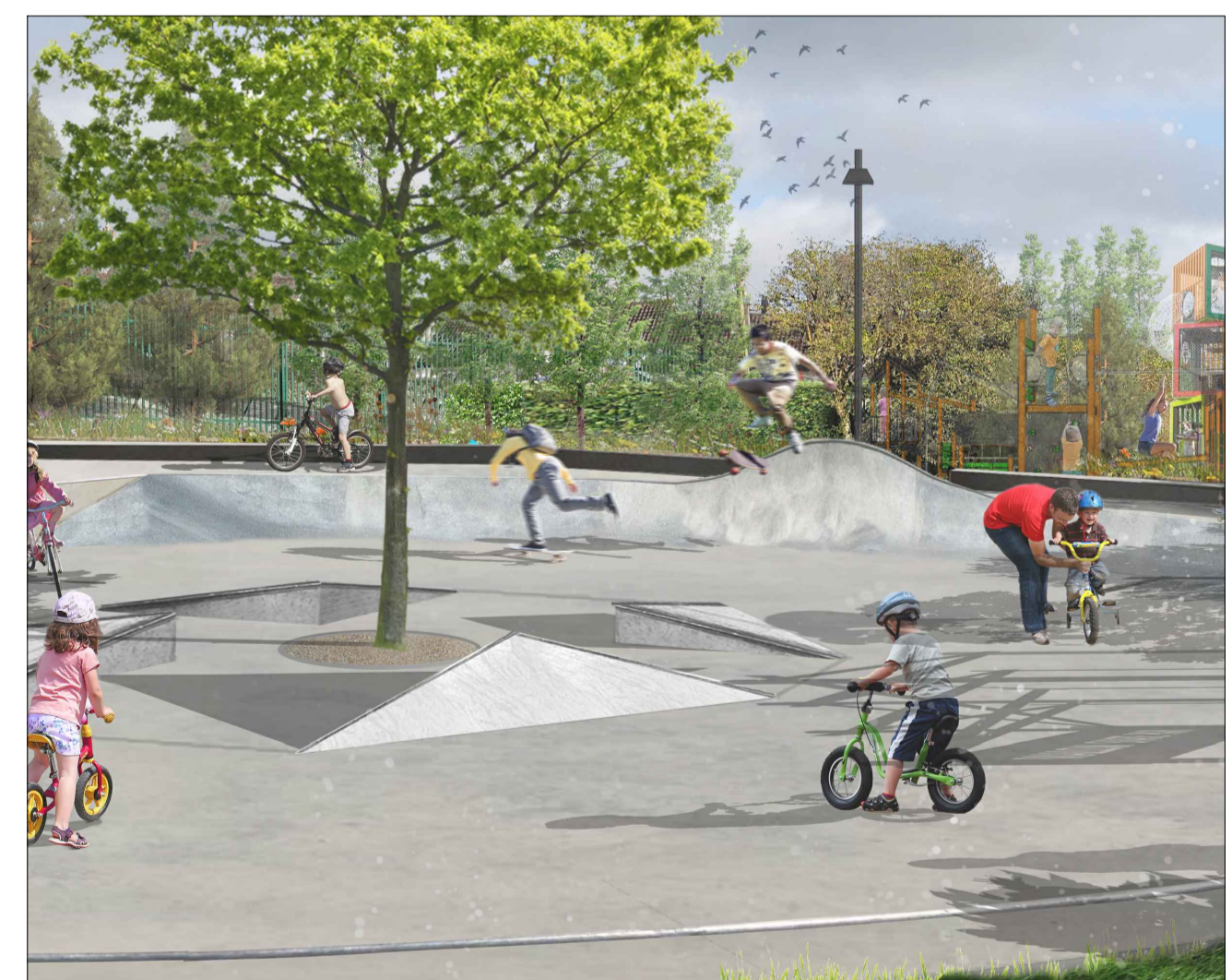
Proposed Skate park