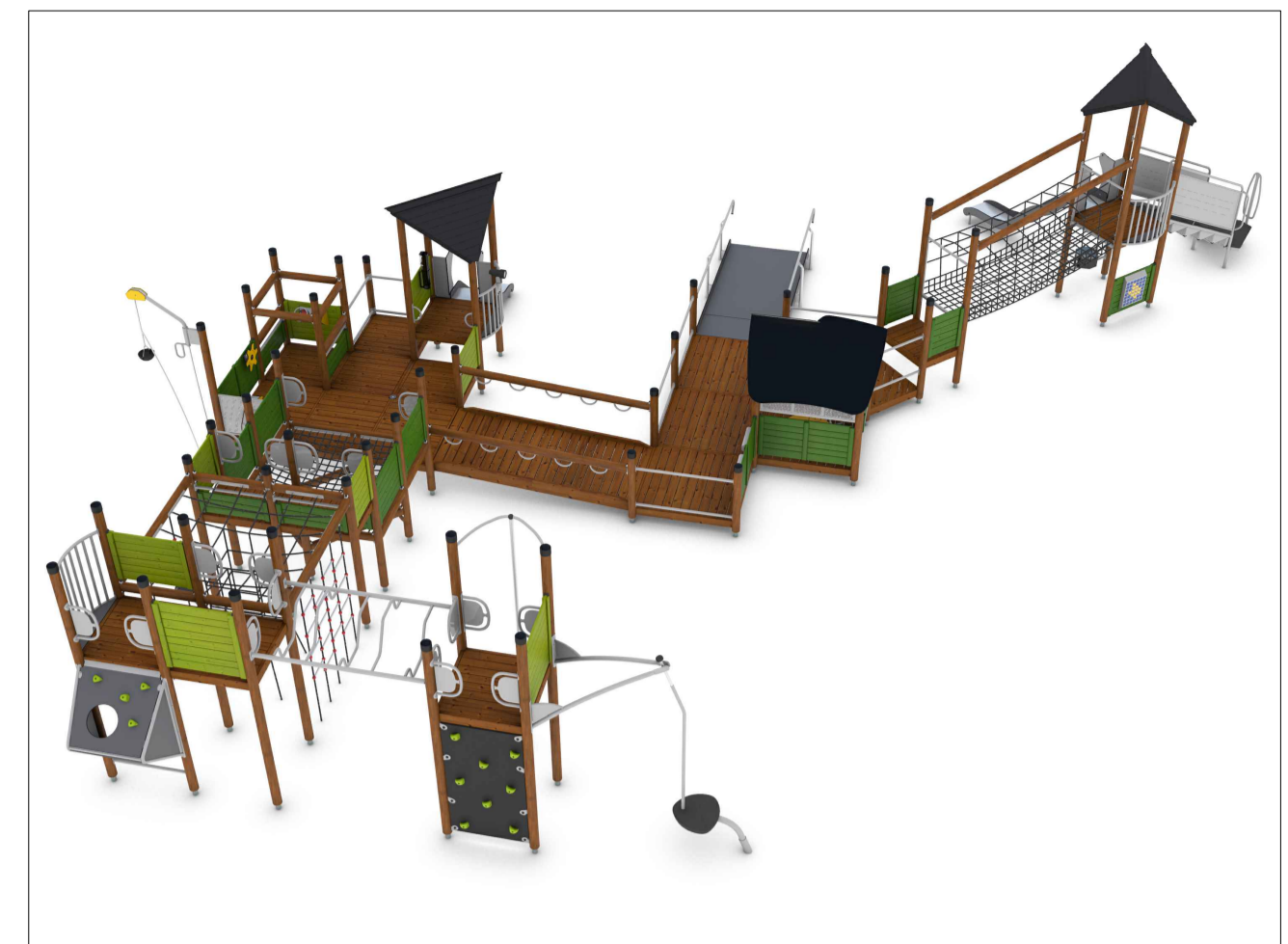
Proposed play unit (4m high)