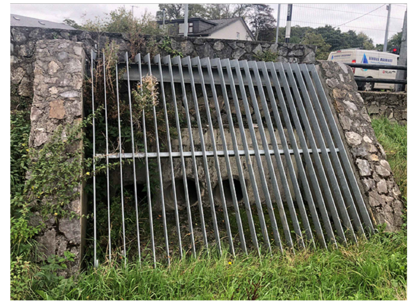
PHOTO '1' EXISTING HEADWALL AND SCREEN DETAIL AT ROADSIDE