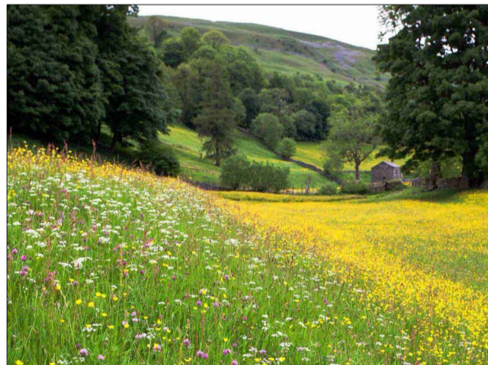
Proposed detention basin meadow