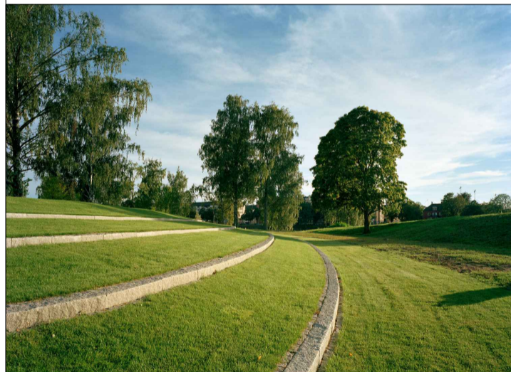
Proposed grassed amphitheater overlooking proposed detention basin