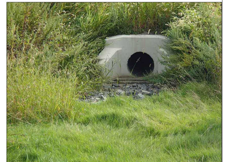
Proposed wetland/ landscaped culvert inlet