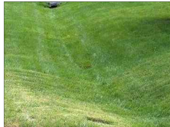
Proposed grassed detention basin