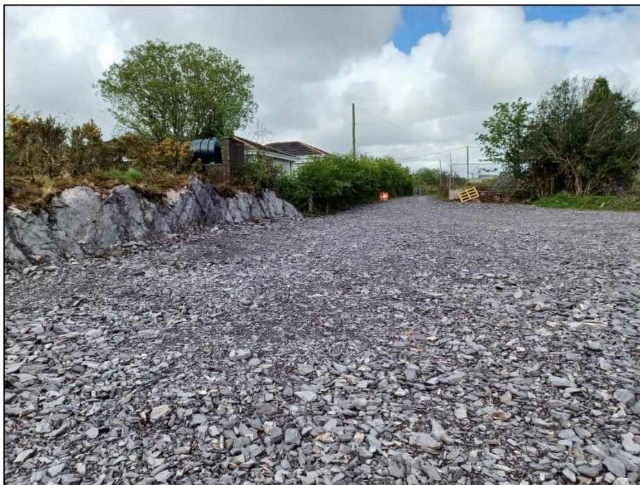
Improvements to the entrance of the community facility in Cúl Aodha

Below are some images of completed projects in Cúl Áodha and Inchigeelagh funded with assistance from the Community Fund.