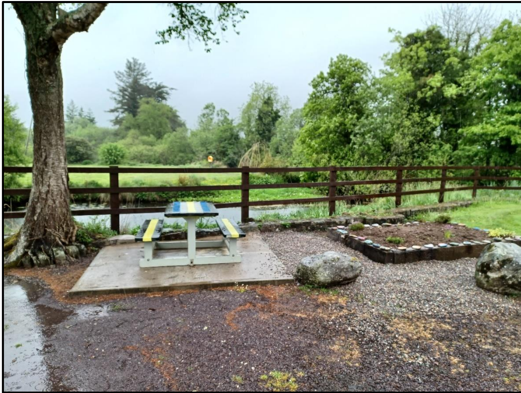
New picnic area at The Island Inchigeelagh