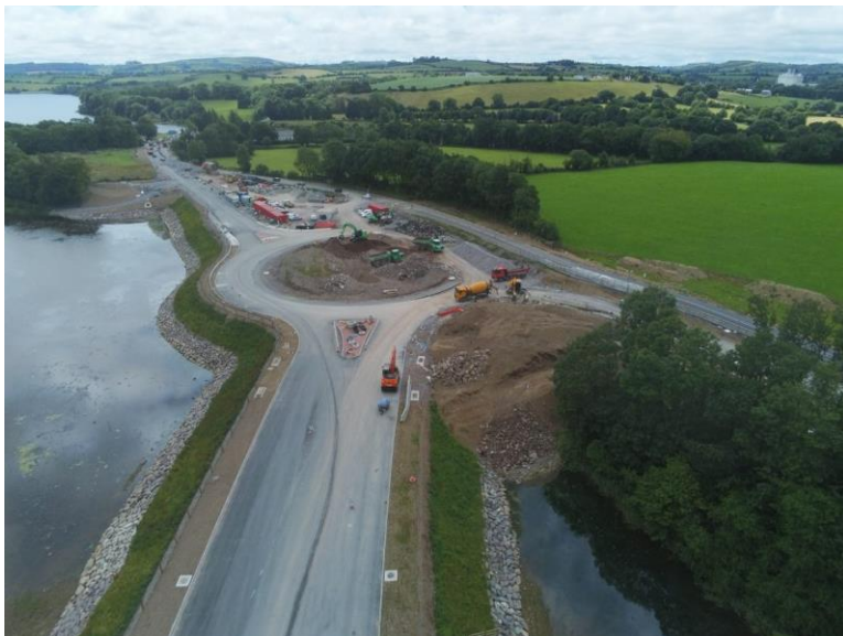
Coolcour Junction.

Drone footage of the development in progress can be viewed here: https://youtu.be/A0uHFSqHY2g