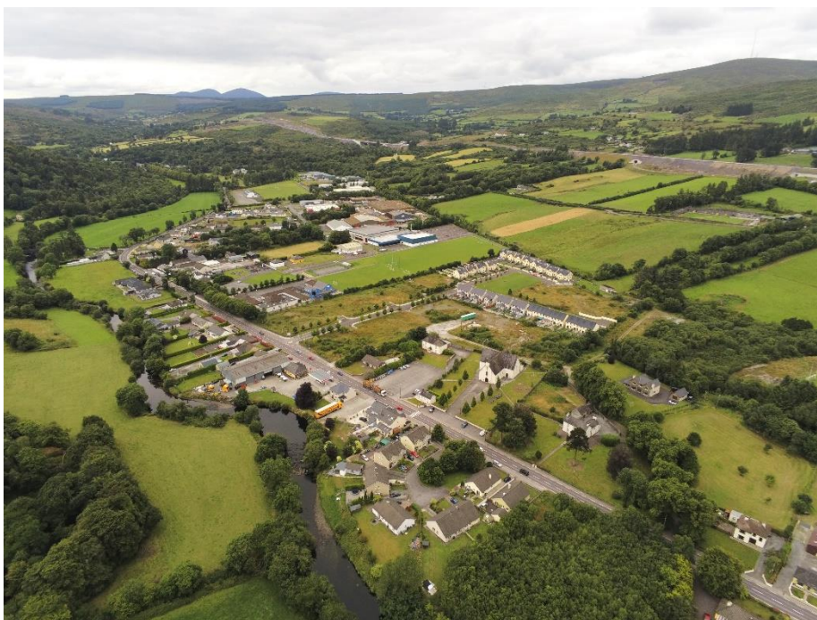
Baile Bhuirne

The Gearagh is close to Macroom. This diverse eco-system and is home to huge variety of fish, birds, trees, plants, and animals such as kingfishers, otters, and whooper swans. It is the only ancient post glacial alluvial forest left in Western Europe. It has been a statutory nature reserve since 1987 and is also part of the Lee river Hydroelectrical scheme. The wider geographical area for this scheme is also a habitat for bats, the Kerry slug, freshwater pearl mussels and owls. The N22 development traverses the upper reaches of the Carrigadrohid Reservoir, which is located on the River Lee, upstream of the two hydro power stations. The lake is predominantly associated with coarse fishing for bream, rudd, roach, pike and perch.