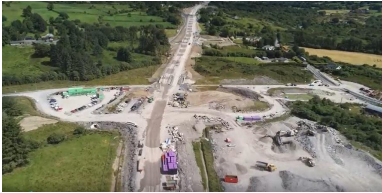
Toonlane Junction.