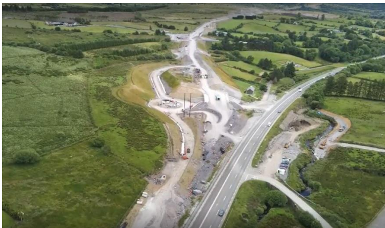
Baile Bhuirne Junction / Western Tie-In.