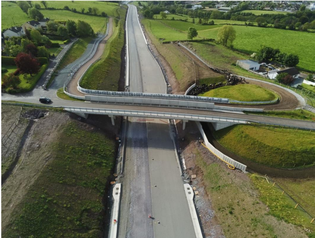
Cattle crossing, Cut 11, north of Macroom.

Macroom is a market town in County Cork, Ireland, located by the River Sullane, halfway between Cork City and Killarney. The town serves an area of central Cork that is rich in agriculture and food production, which is also celebrated as part of the annual Macroom Food Festival. The town is home to several artists, arts groups and organisations including the Briery Gap theatre which is currently being renovated.