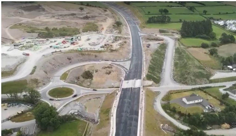
Gurteenroe Junction