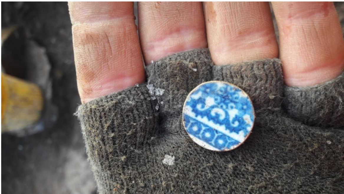
Ceramic Gaming Piece found in Kilclug 1

A total of 25 sites of prehistoric date were excavated along the route of the new N22 prior to construction commencing. The majority of these consisted of Bronze Age burnt mounds or fulacht fiadh , an enigmatic site type where stones were heated in a fire before being placed in a prepared water-filled trough in the ground, the purpose being to heat the water for various reasons, bathing or cooking being the most likely explanation in most cases. Such troughs are often either stone or timber lined, and many complex examples with well-preserved wooden lining were seen here. These sites were found in many locations along the scheme. Further prehistoric sites included a Bronze Age cremation burial of a young woman.