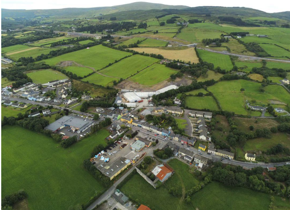
Baile Mhic Íre.

The Gearagh is close to Macroom. This diverse eco-system and is home to huge variety of fish, birds, trees, plants, and animals such as kingfishers, otters, and whooper swans. It is the only ancient post glacial alluvial forest left in Western Europe. It has been a statutory nature reserve since 1987 and is also part of the Lee river Hydroelectrical scheme. The wider geographical area for this scheme is also a habitat for bats, the Kerry slug, freshwater pearl mussels and owls. The N22 development traverses the upper reaches of the Carrigadrohid Reservoir, which is located on the River Lee, upstream of the two hydro power stations. The lake is predominantly associated with coarse fishing for bream, rudd, roach, pike and perch.