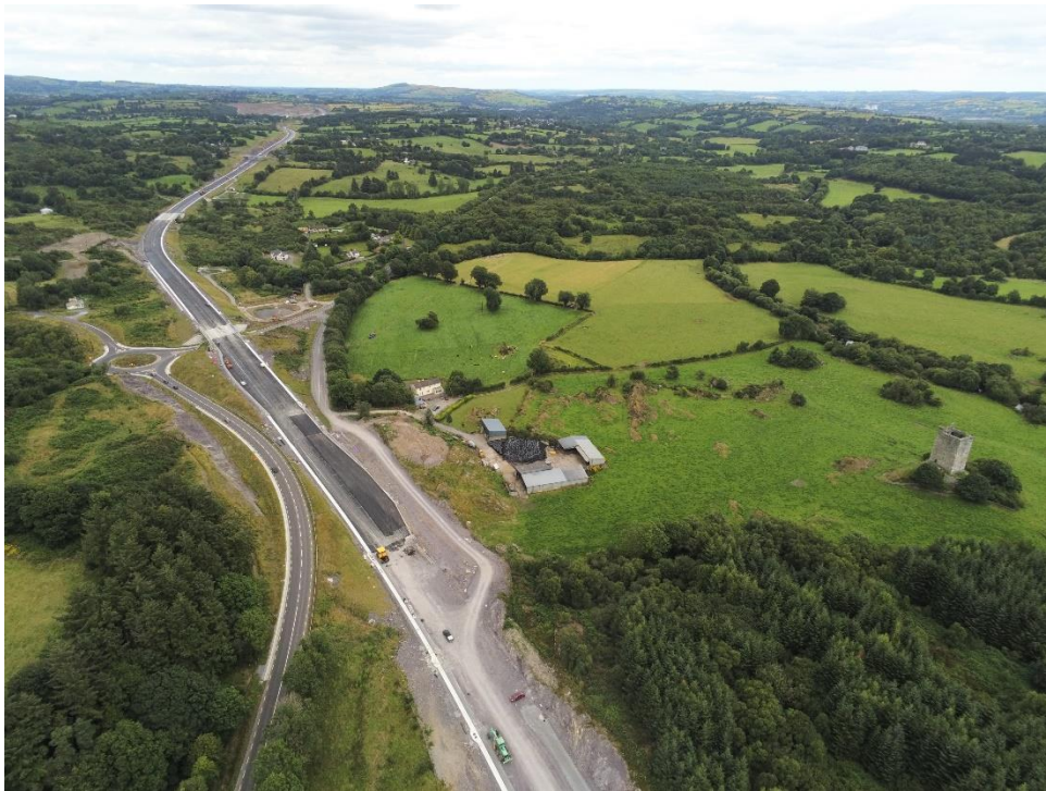
Carrigaphoooca Castle.

Carrigaphoooca Castle is situated on the outcrop of rock called The Friary Rock in Macroom, County Cork. It is a 16th century tower of 4 storeys below a vaulted roof and turrets on opposing corners at the top. It was built by Dermot Mór MacCarthy sometime between 1436 and 1451. A staircase was added in the 1970's. There is a stone circle two fields to the east of the castle.