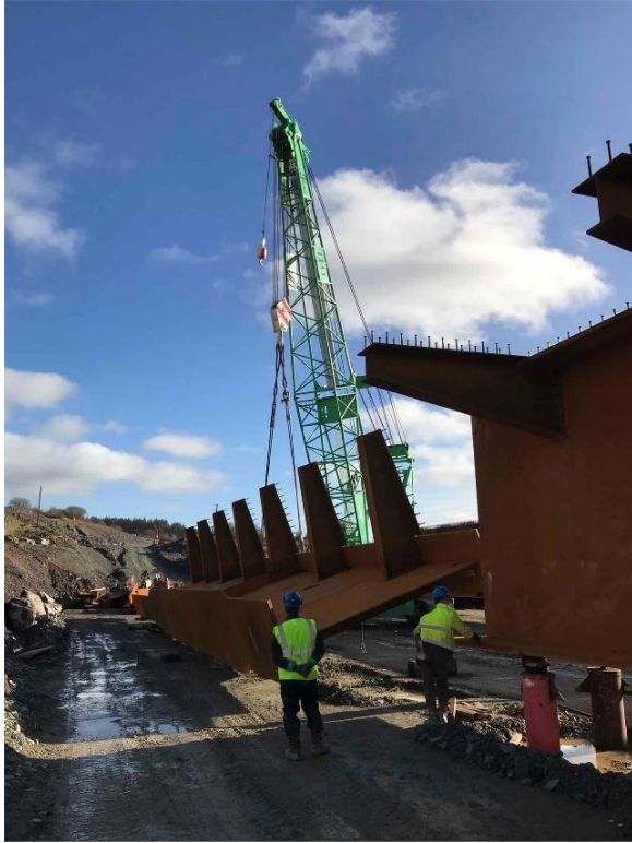
Bohill River Bridge.

The N22 development provides a 22 km road improvement from the Cork side of Macroom, bypassing the Town of Macroom, the villages of Baile Mhic Íre and Baile Bhuirne, the infamous Baile Bhuirne bends, and finishing on the improved section of the N22, just west of Baile Mhic Íre itself and before the County bounds with Kerry.