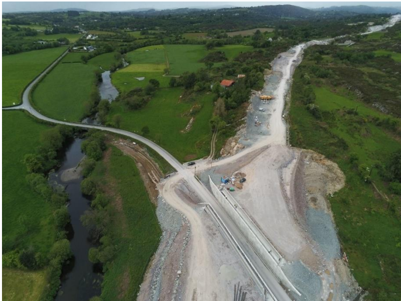
Cill na Martra Road.

An Ionad Cultúrtha an Dochtúir Ó Loinsigh is an arts centre serving the Gaeltacht Mhuscraí, located in Baile Bhuirne. It offers a yearlong arts programme including visual art, music, residencies for visiting artists and courses for the general public.