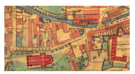
Extract from hand-coloured Ordnance Survey map of Cork City, c. 1870

Trinity College (Click here to go direct to web page) map library holds a large collection of historic maps including the 17th century Down Survey. The library can conduct map searches for professional users for a fee.