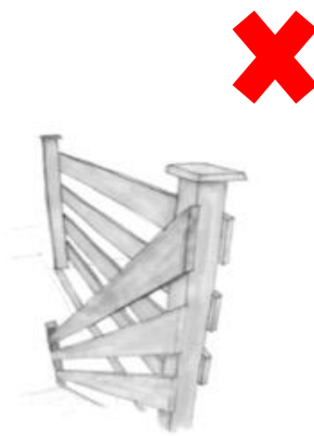
An example of an unsound stair guarding