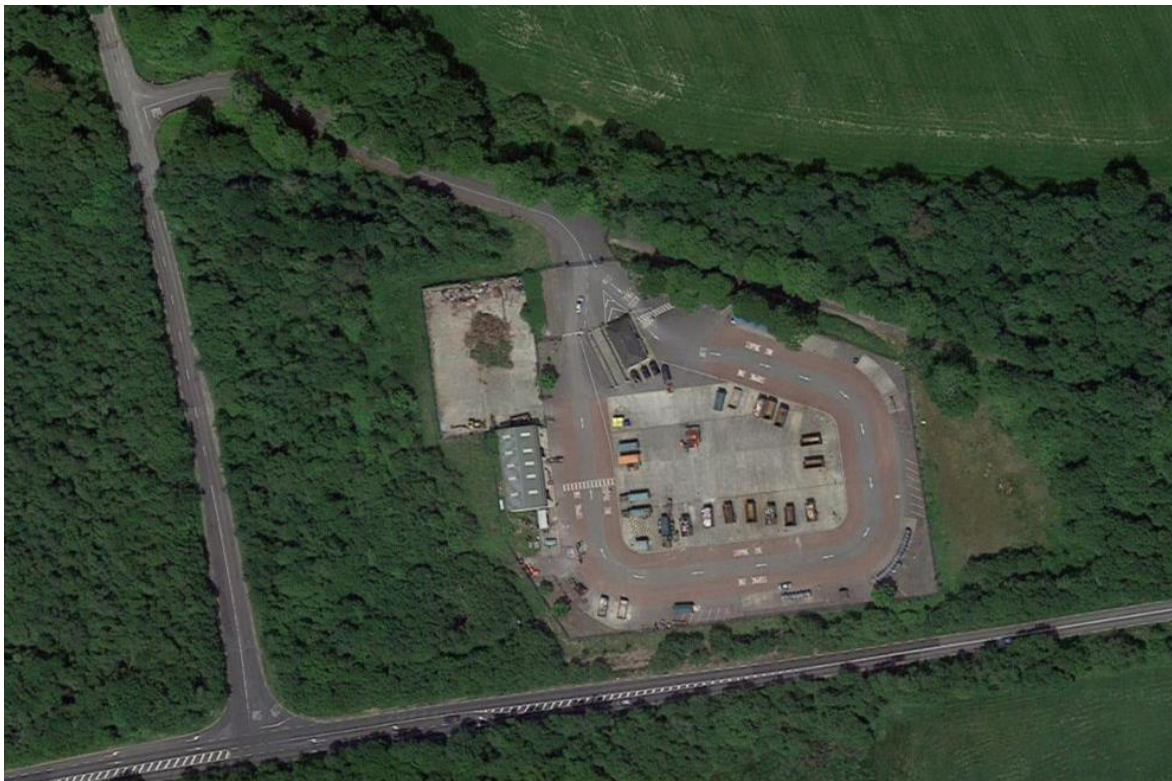
Figure 2 Current site conditions

The study area is located at the west of Bandon town, within an existing Bandon Civic Amenity Site at Killountain west of Bandon town. Site is adjacent to the N71 and disused West Cork rail line with an access from the local road L2019. The site is completely surrounded by woodland.