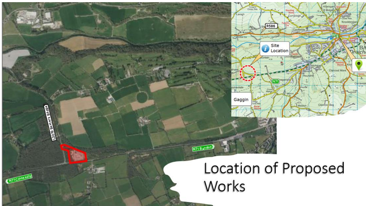
Figure 1 Study Area

The study area is located at the west of Bandon town, within an existing Civic Amenity Site at Killountain in Bandon. Site is adjacent to the N71 with an access from the local road L2019. (See Figure 1)