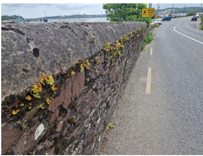
Plate 11: Stonewall.