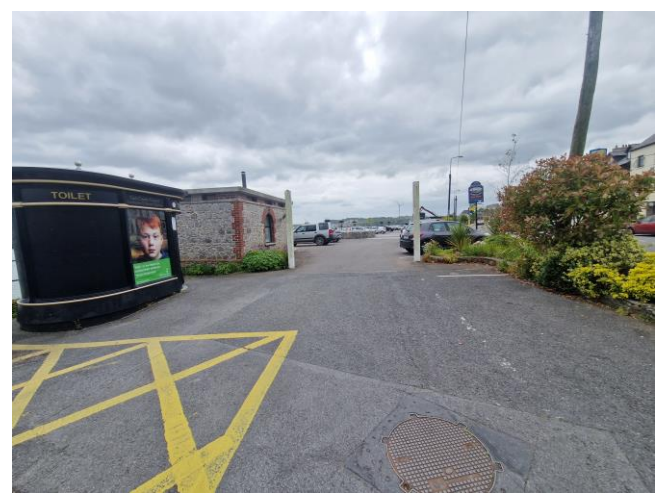
Plate 3: Public toilets and small building.