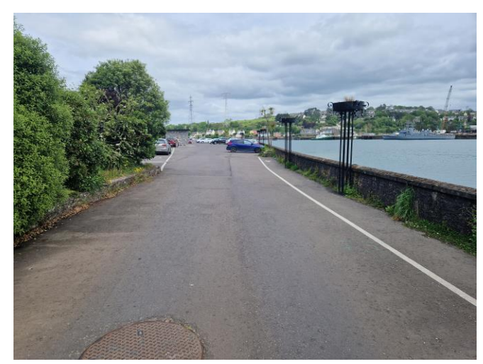
Plate 5: Seawall.