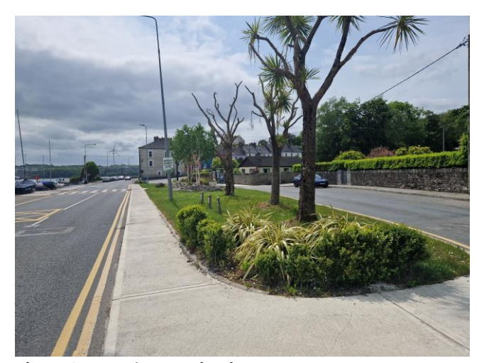
Plate 10: Amenity grassland area.