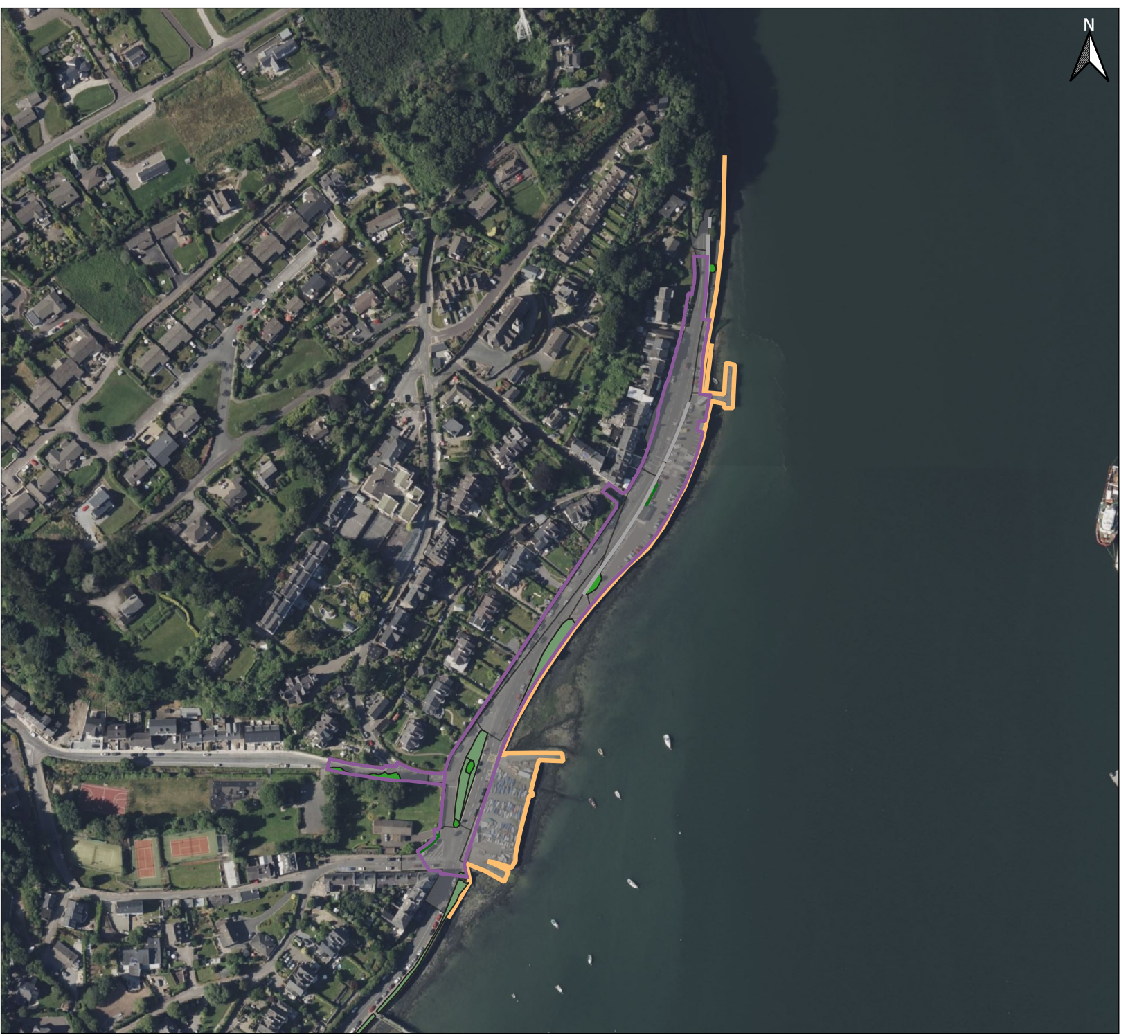
Figure Reference: P112259 Monsktown Habitat Survey