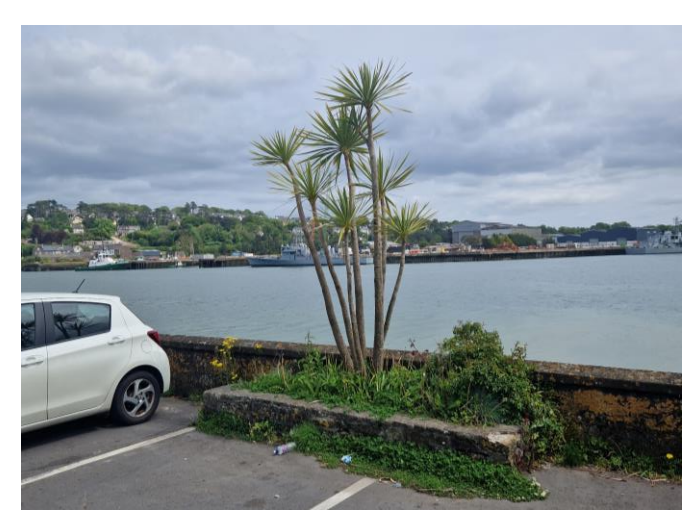
Plate 12: Flowerbed.