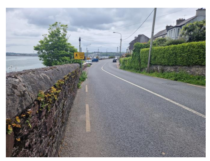
Plate 1: Road at North end of Site.