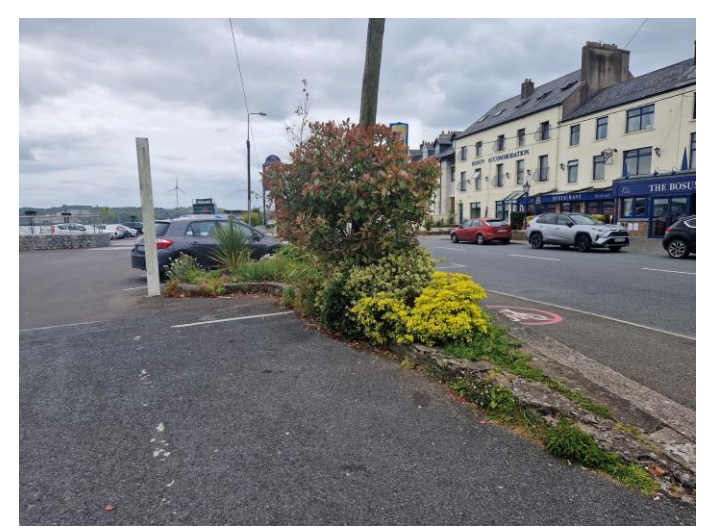
Plate 6: Flowerbed.