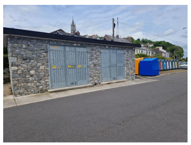
Plate 9: Electrical building and recycling area.