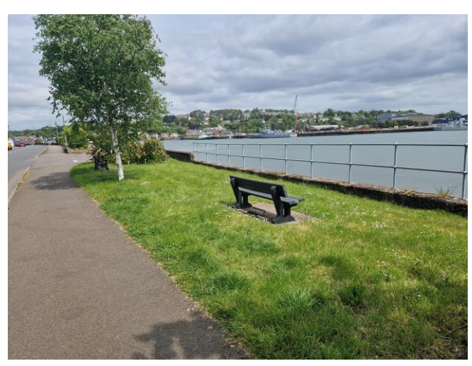
Plate 4: Amenity grassland area.