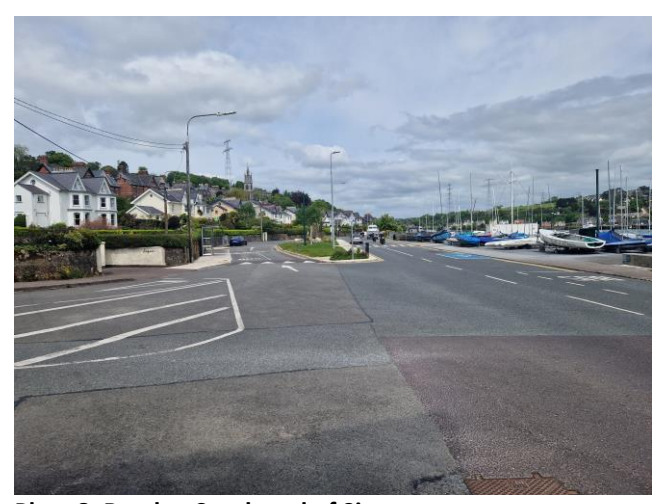
Plate 8: Road at South end of Site.