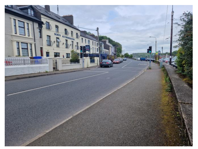
Plate 7: Road with footpaths through Monkstown.