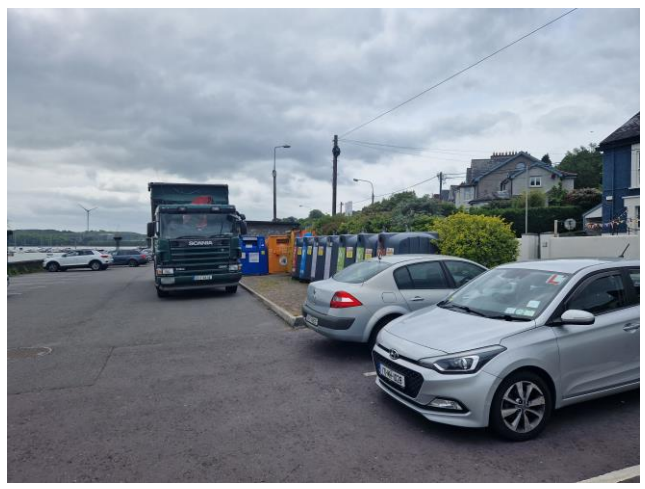
Plate 2: Monkstown Carpark.