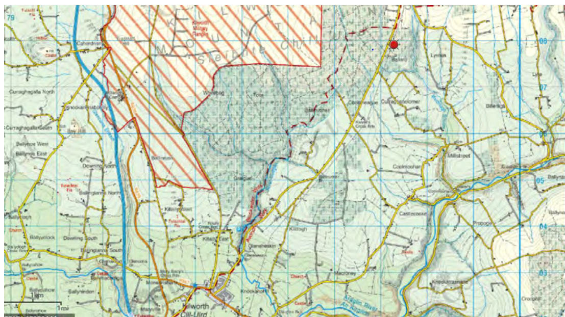
Fig 1: Location Map for Ballard

In addition to the Blackwater Way trail, there is also a moderate looped walk which features the Ballard Waterfall along its route.