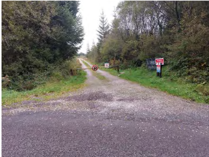
Fig 6 – Existing access and Forestry Road