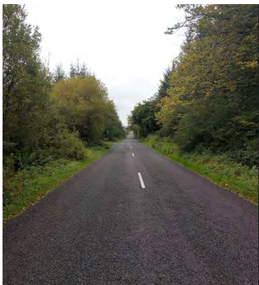
Fig 5 – Existing Access in centre with slightlines

A pedestrian path is proposed to be constructed from the car park to the existing forestry road as indicated.