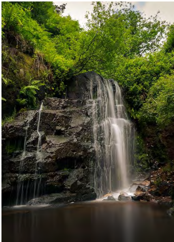
Fig 3 – Ballard Waterfall

Fig 2 above shows the Ballard Waterfall Trail is located at Mountain Barrack, which is a moderate 5.4km looped walk and takes about 1 hour 30mins.