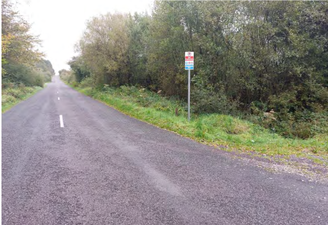
Fig 4 – Proposed Car Park is proposed to be located on RHS (at the other side of the boundary ditch)

A Level survey is included in the drawing pack, which shows that the site is reasonably level with a slight fall from north to the south.