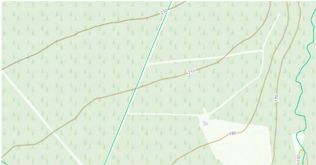
Fig 7 – Map of site and surrounding area with no archaeological sites (Ref Heritage Data maps)

Following consultation with the Archaeological and Conservation Office of Cork County Council it was confirmed that no architectural heritage issues arising with the proposed site.