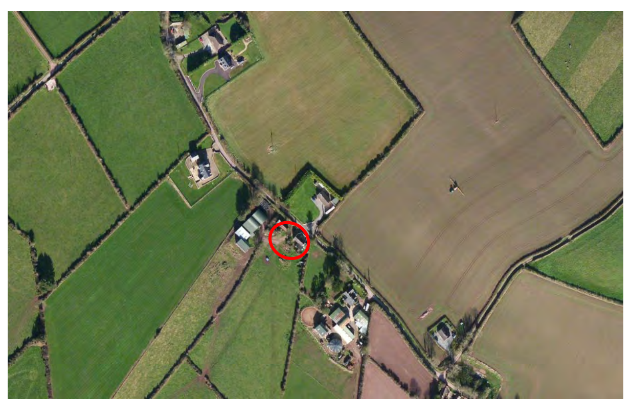
Figure 1: Site Location at Ballycurraginny, Killeagh.

The subject site is located at Ballycurraginny, approximately 2.4km to the north-east of Killeagh and the vehicular entrance subject of this section 5 report is associated with an existing dwelling house adjacent the public road. There are a series of farm buildings on the adjoining site to the north-east and a bungalow dwelling is located in a more elevated position directly opposite.