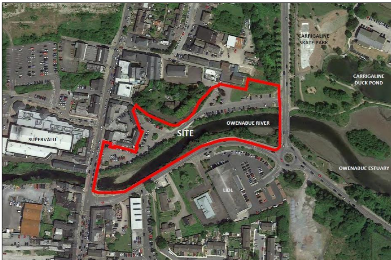
Figure 1 Site Location (Red Line) in surrounding context.

The proposed development site is on the northern bank of the River Owenabue within Carrigaline Town Centre. The site is currently in use as a through road and car parking area and is accessed via the R611 Cork Road to the west and the R612 Crosshaven Road to the east. The site is bounded to the north by commercial properties and some planting. The site is located within the Carrigaline development boundary and is designated within CL-T-01, “Town Centre/Neighbourhood Centre” land use zoning within the Cork County Council Development Plan 2022-2028. See Figure 1 below for site location.