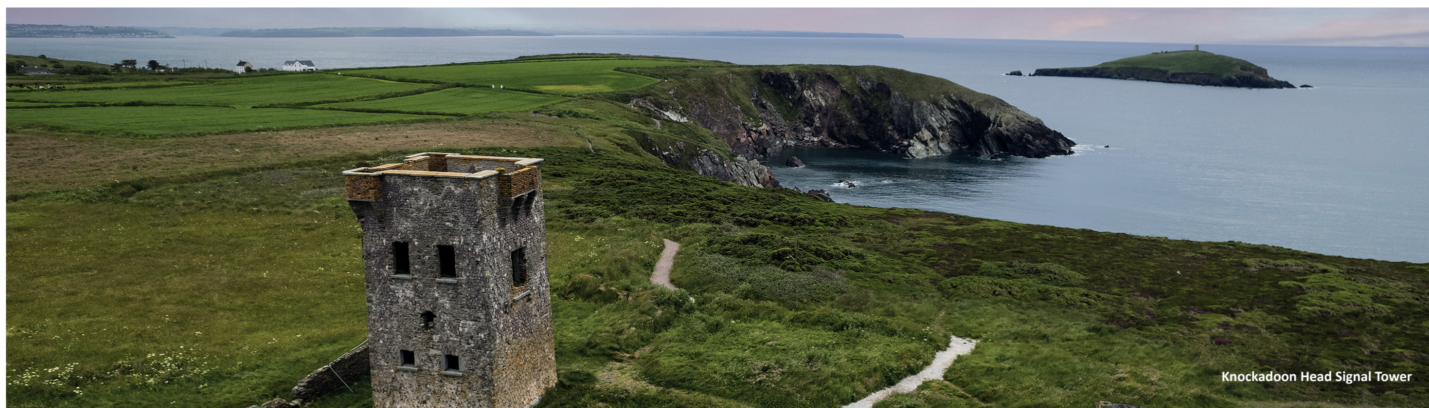
Knockadoon Head Signal Tower