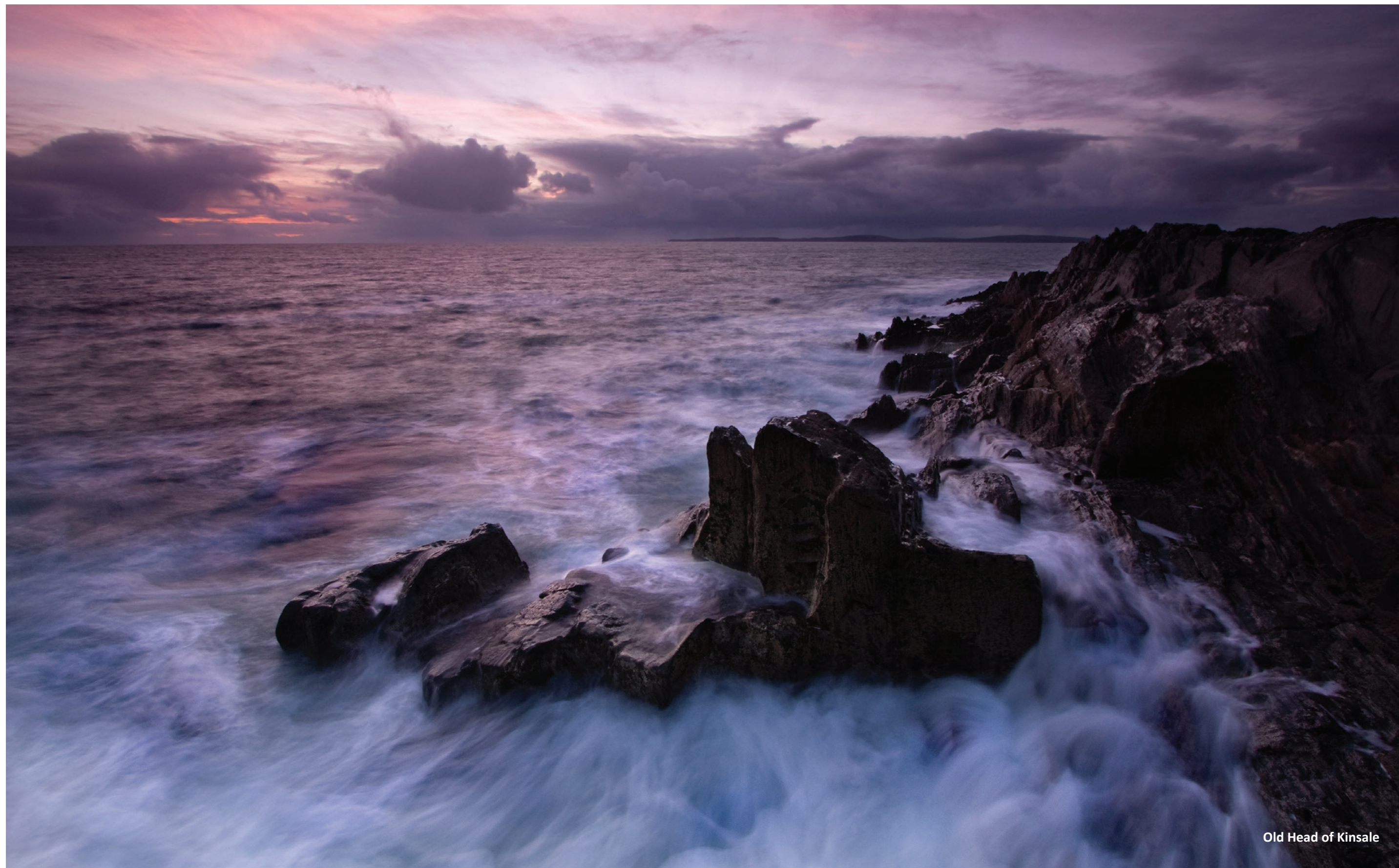
Old Head of Kinsale