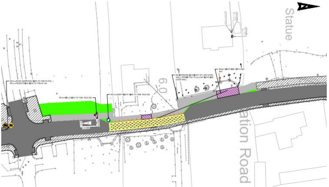
Figure 1 - Location 1 - Section 38 Proposals