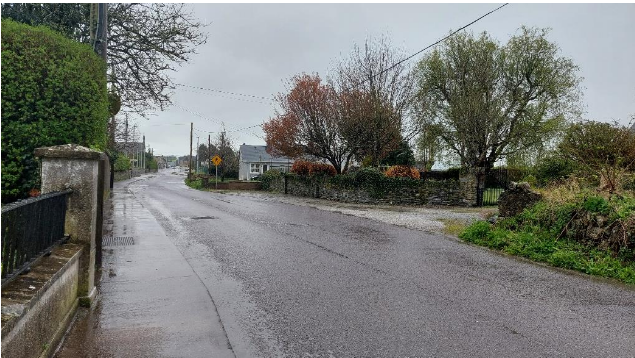
Figure 4 - Location 1 - Station Road looking south.