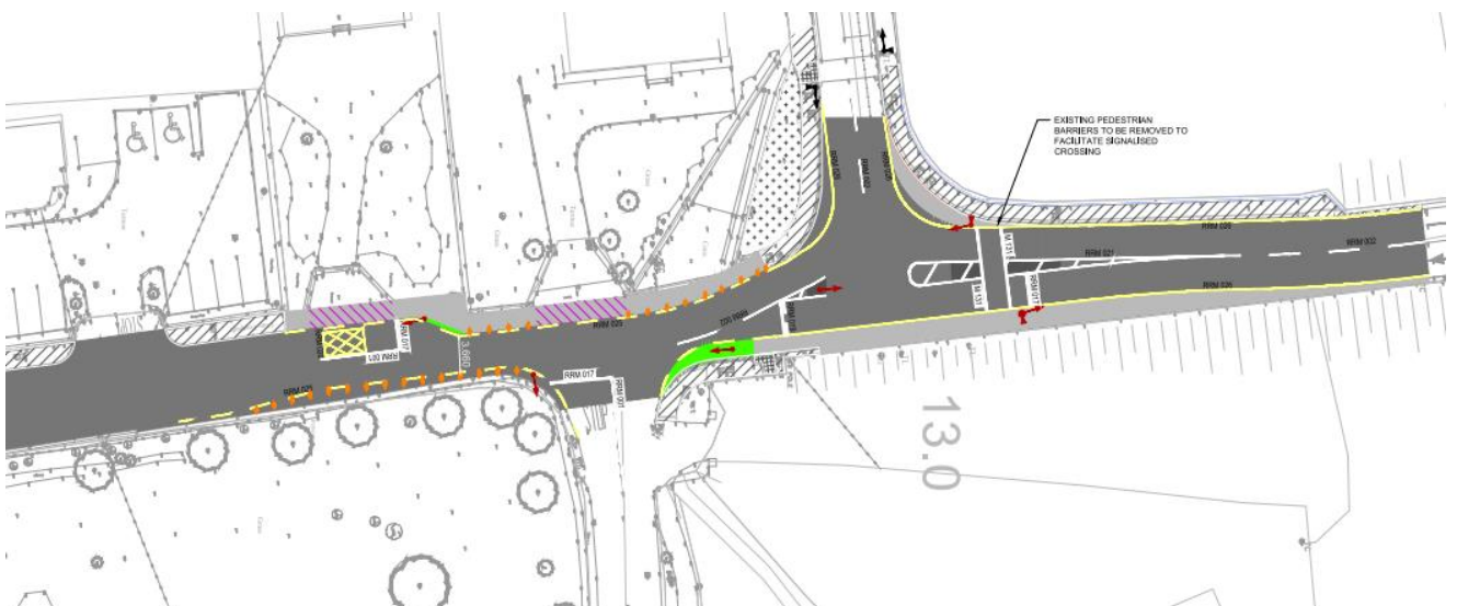
Figure 2 - Location 2 - Section 38 Proposals

The proposals at Location 2 are shown in Figure 2 below. The road width would be narrowed to 3.75 metres over a distance of c. 40m to allow for the construction of a minimum 2-metre-wide footpath on the west side of the road at this location. The reduced road width would allow for traffic signal operated one-way shuttle operation through the reduced road width section.