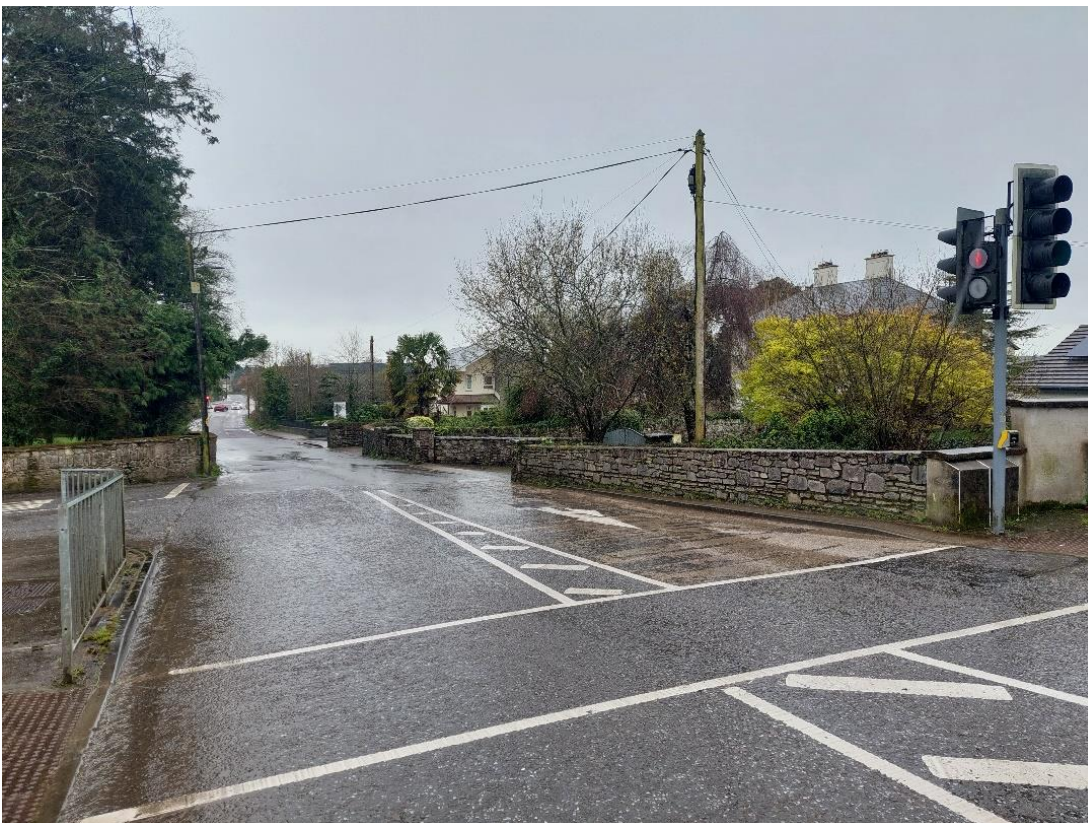
Figure 6 - Location 2 - Station Road looking south.