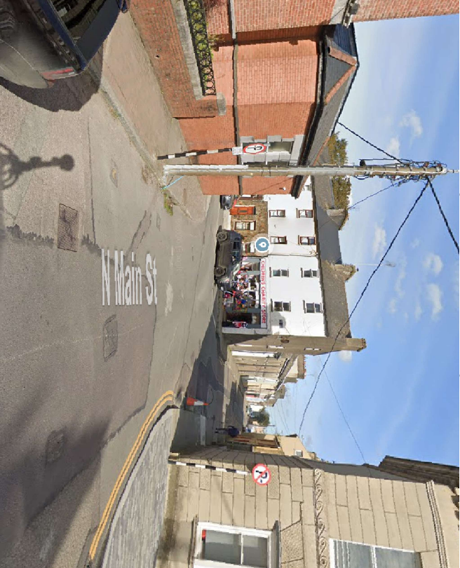
Photo of existing junction